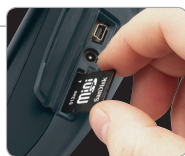
Removable SD Card and USB Output for Fast Image Downloads