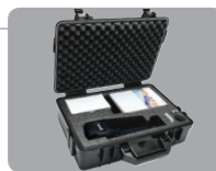
Includes Hard Case