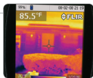
Excellent 2.8" Color LCD Shows the Whole Scene