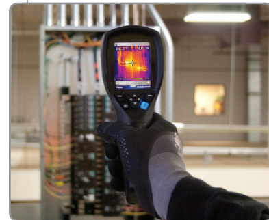
Find Hot Spots Fast!